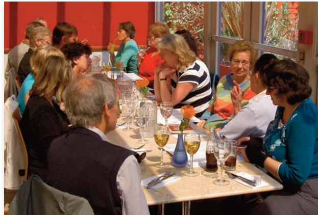
London Pro Art.o.8 re